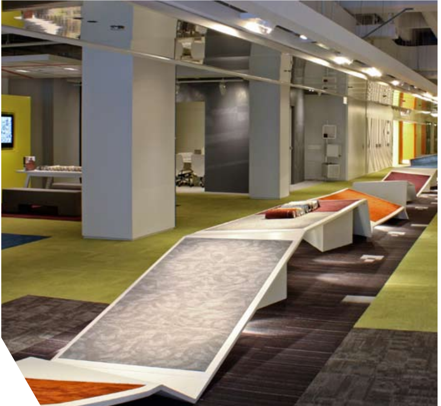
Milliken Showroom, Chicago, IL