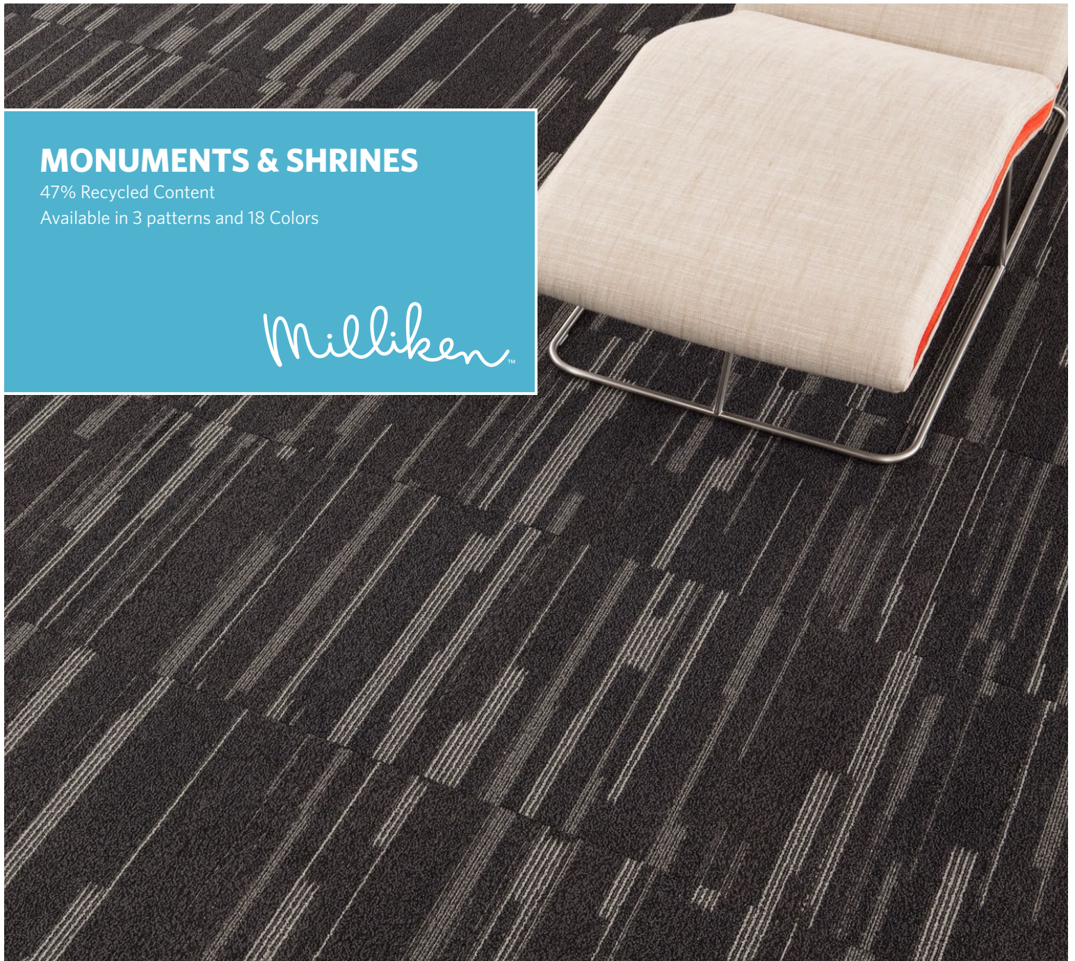
Nugget in Headliner, monolithic installation